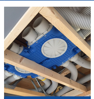
Semi rigid ductwork is ideal for smaller developments.

Having decided on ducting location, the next step is to decide whether to use rigid or semi-rigid ducting. Semi rigid ductwork, such as National Ventilation's Monsoon Radial ducting, is ideal for smaller developments since it is flexible, robust and up to 60% quicker to install. This type of ducting also means fewer mistakes, since even a novice can Install it to a high standard, resulting in an airtight installation and Improving system performance. With a plethora of plenums and accessories this system can overcome over 99% of issues that may occur on-site.